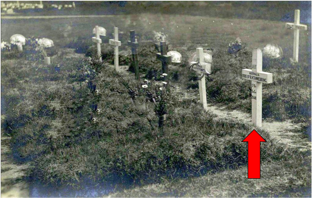
Sapper Tannebring's Original Cross Marker