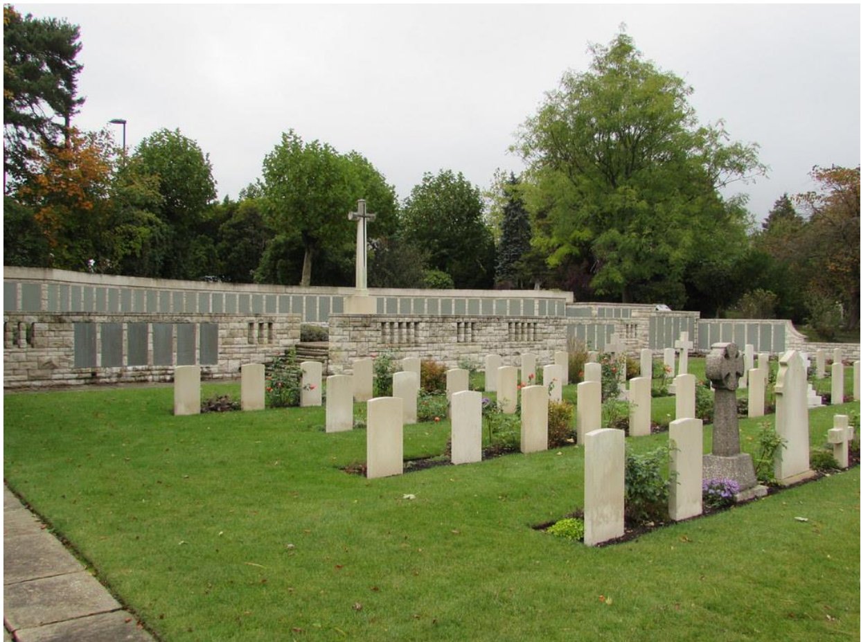
Hollybrook Cemetery with Hollybrook Memorial at front