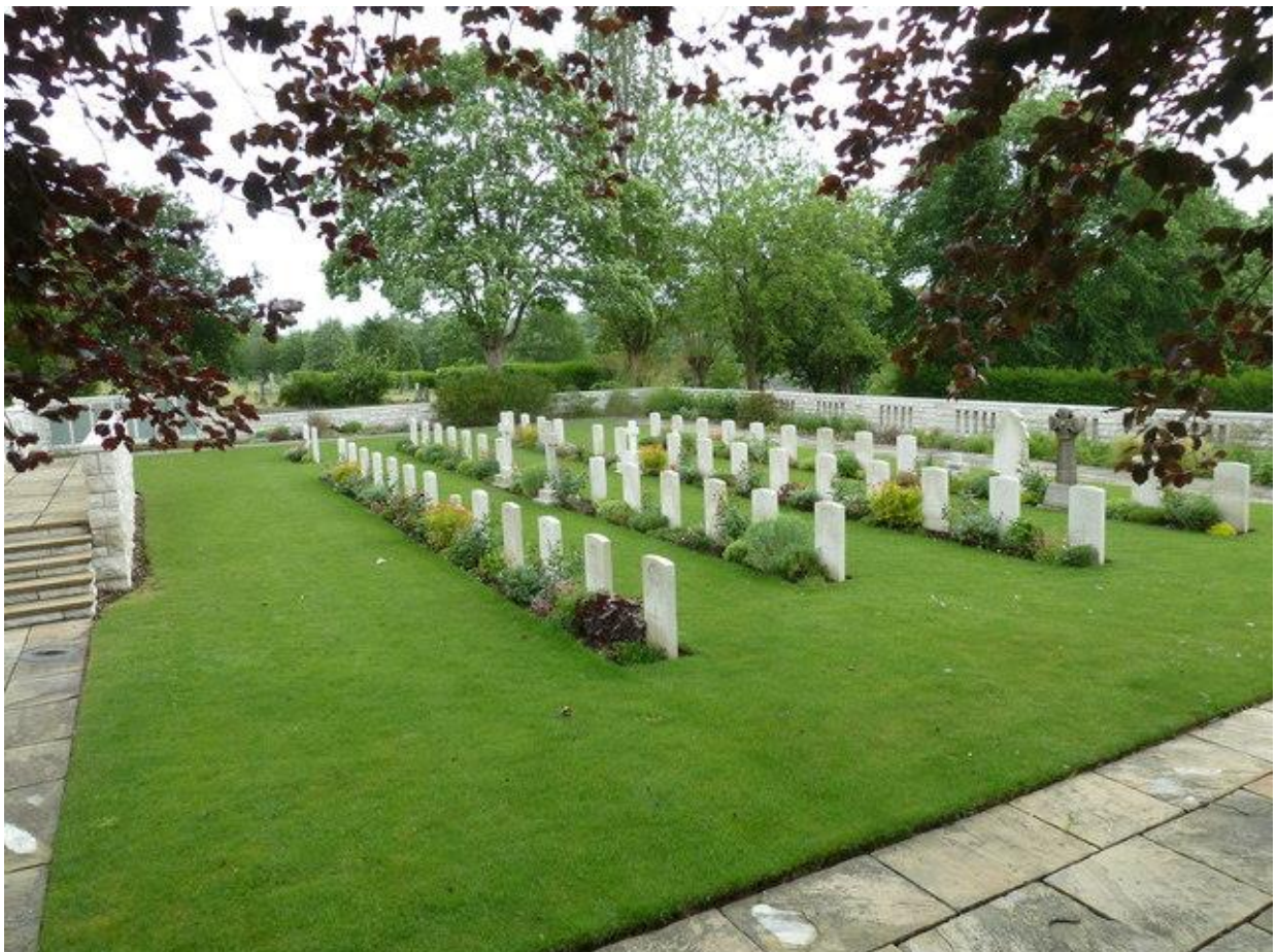
Hollybrook Cemetery (Photo below from 2012 – Basher Eyre)