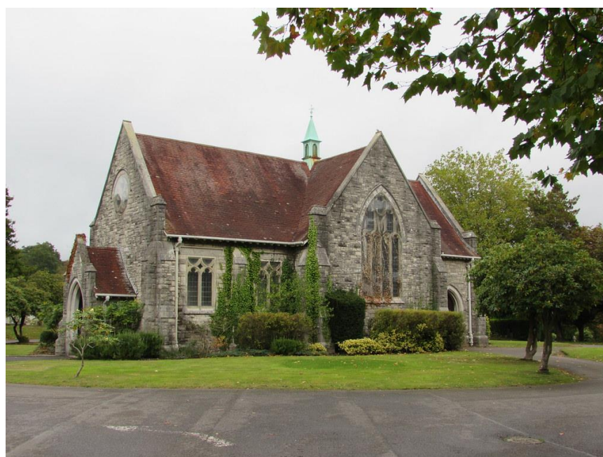
Chapel at Hollybrook Cemetery